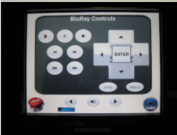
Crestron Touch Panel